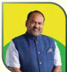
Mr. Mahadev Jankar Saheb Founder & National President of Rashtriya Samaj Paksha

27- 28- 29 December 2024 Auto Cluster Exhibition Centre MIDC, Pimpri Chinchwad, Pune